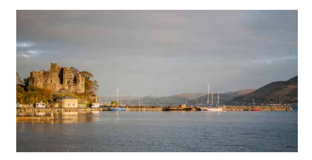
'Once in a while, right in the middle of an ordinary life, love gives us a fairy-tale.'