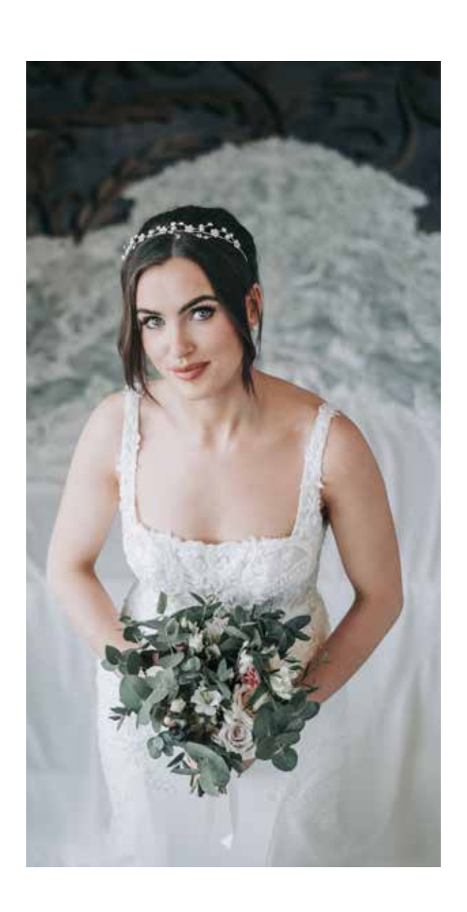
The Staircase 'The staircase made for wedding dress trains'