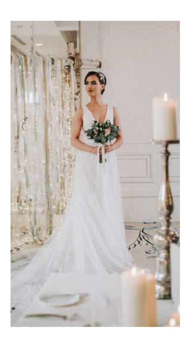
A day for you, made by us.