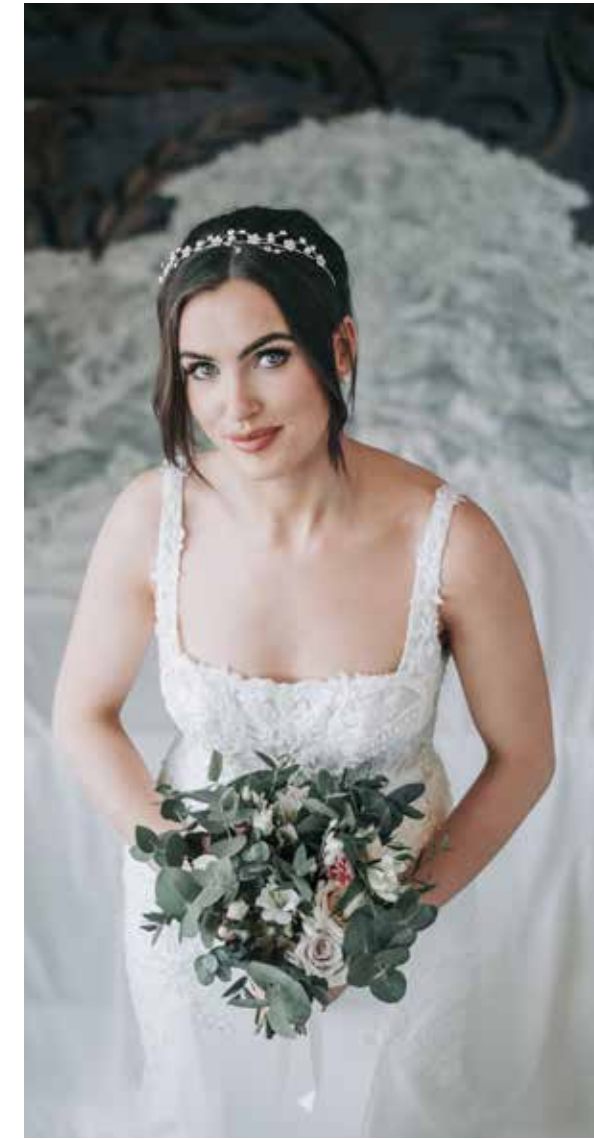
The Staircase 'The staircase made for wedding dress trains'