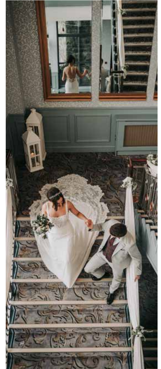
The Staircase 'The staircase made for wedding dress trains'